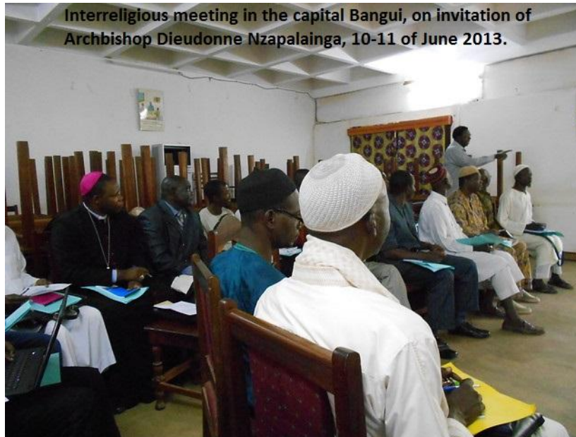
Interreligious meeting in the capital Bangui, on invitation of Archbishop Dieudonne Nzapalainga, 10-11 of June 2013.

“ Turned out that Seleka demand for all refugees to come back home but there's no guarantee. The problem is not the Muslims. They, the Selekas, are the killers. They are the ones who throw dead bodies in the river, who even took it up on me and the Red Cross because we went looking for them. Seleka arrests and tortures people,