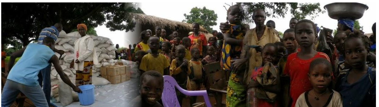
Photo: “Help your people, Oh Lord! Bring your peace and harmony to the people clamoring for your help”.

Letter P. Dieu-Béni Mganga, 5th December, Archidiócesis de Bangui